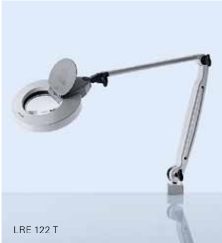
LRE 122 T

LRE 122 T Diagnosis light on stand. Multiple mounting options: Wall bracket, table foot or clamp, 5-feet on castors.