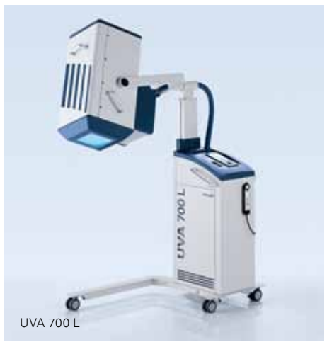
UVA 700 L

UVA 700 L High performance system for photoprovocation tests and therapeutic UVA and PUVA applications. High dosage ranges possible.