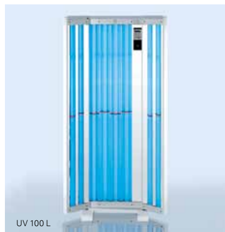
UV 100 L