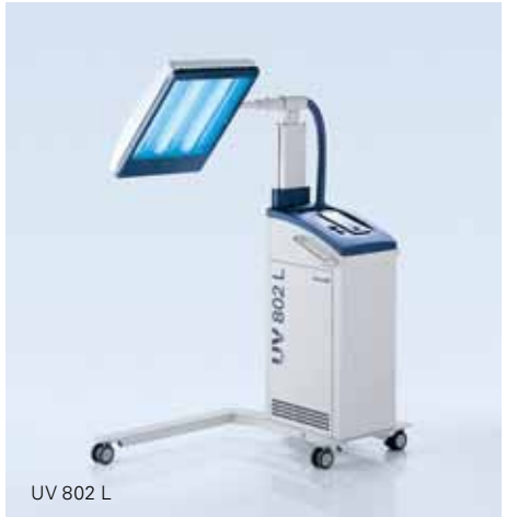
UV 802 L

UV 802 L Partial body therapy systems for versatile use. Monotherapy: UVA, PUVA, UVB narrow band, UVB broad band. Combination therapy: UVA and UVB narrow band synchronously, UVA and UVB broad band synchronously. For diagnosis: MPD and MED tests with VARIOCONTROL and TEST UNIT. With LCD timer for dosage entry in Joules/cm 2 .