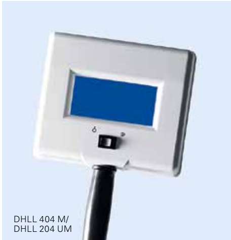
DHLL 404 M / DHLL 204 UM

DHLL 404 M / DHLL 204 UM Single Wood's light or as combination model with a toggle switch for neutral white fluorescent tube light.