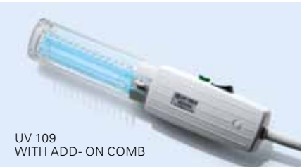
UV 109 WITH ADD-ON COMB

TEST UNIT Optional accessory to the VARICON-TROL device for the determination of erythema doses, separated according to UVA and UVB.