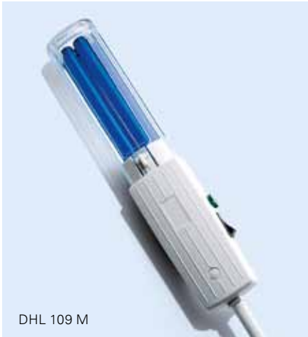
DHL 109 M

DHL 109 M Handy and lightweight hand wood-light for detection of fluorescence of disorders and assessment of pigment changes.