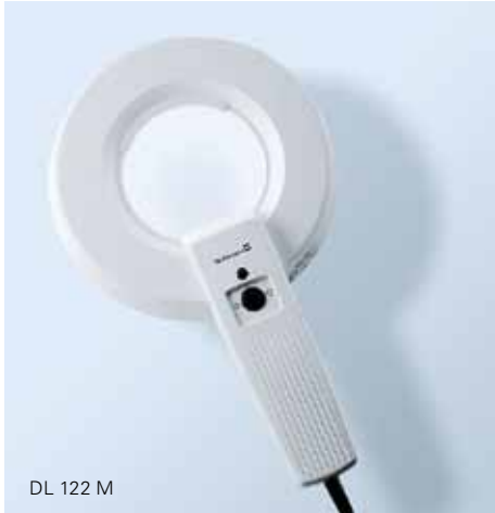
DL 122 M

DL 122 M Diagnosis light for versatile use in all dermatological examinations.