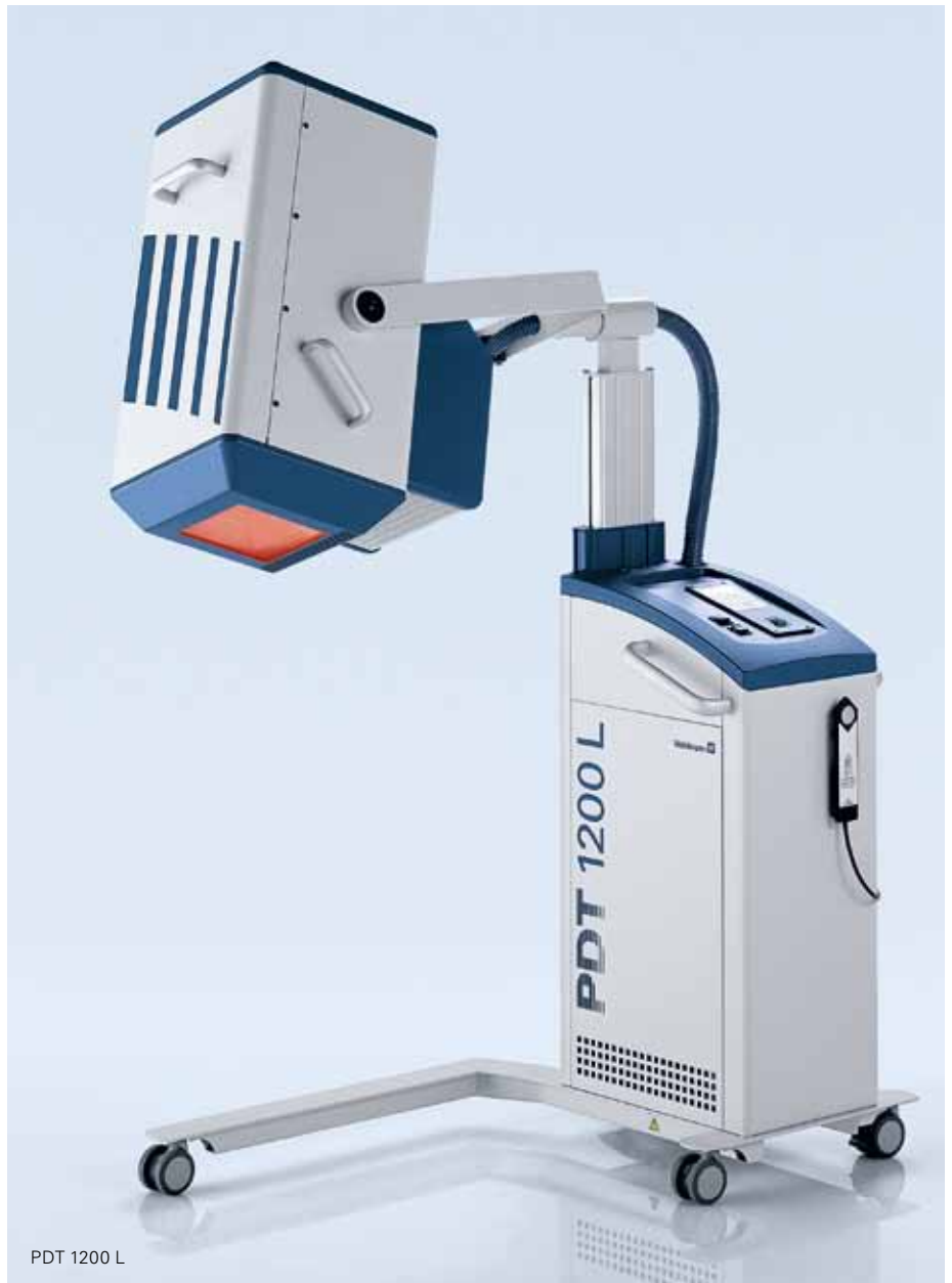
PDT 1200 L

The freely adjustable irradiance of up to 200 mW/cm 2 may especially be important for the treatment of oncologic indications.