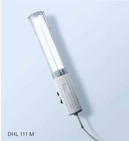
DHL 111 M

A reliable diagnosis is the base for every successful therapy. Waldmann offers a full variety of diagnosis systems in different versions and with many optional accessories.