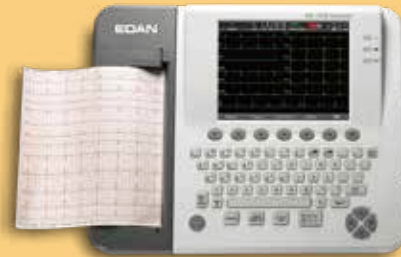
SE-1200 Express Electrocardiograph